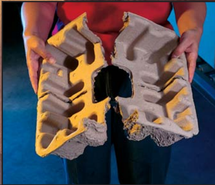
Break apart design improves packing line efficiency by reducing reaching motions.